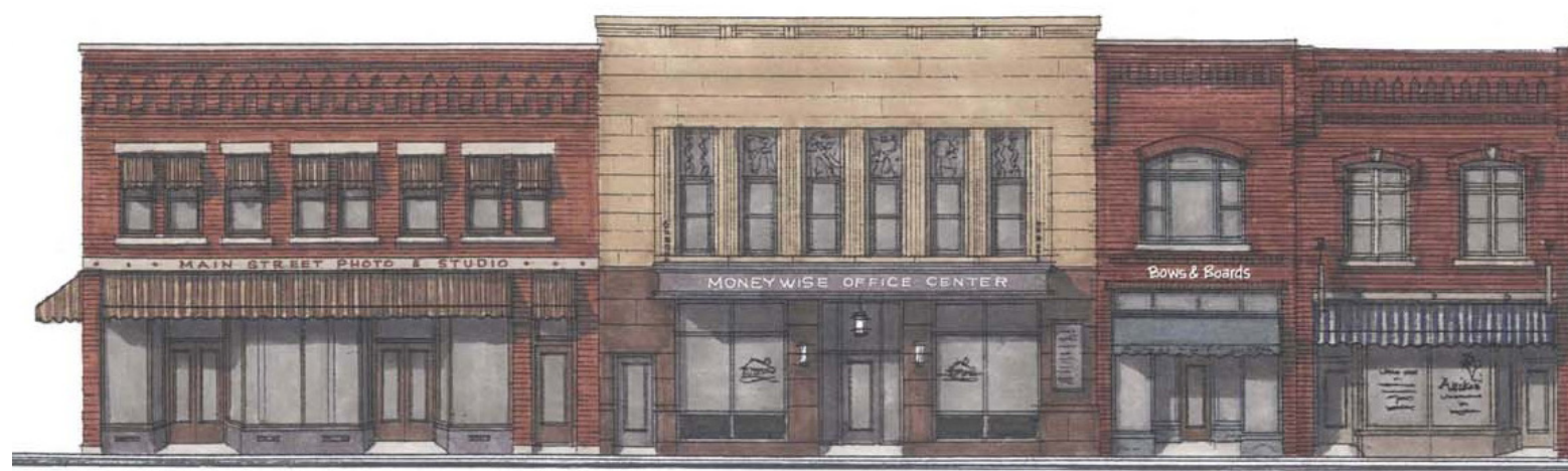
WISCONSIN MAIN STREET FACADE STUDY - 200 BLOCK OF SOUTH CENTRAL AVE. - MARSHFIELD, WI JULY 17, 2008 JOE LAWNICZAK